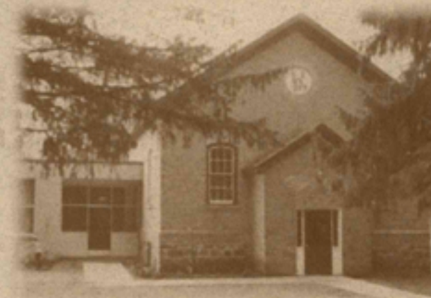
Wilmot Township S.S. No. 6 School, Haysville x.961.069.001